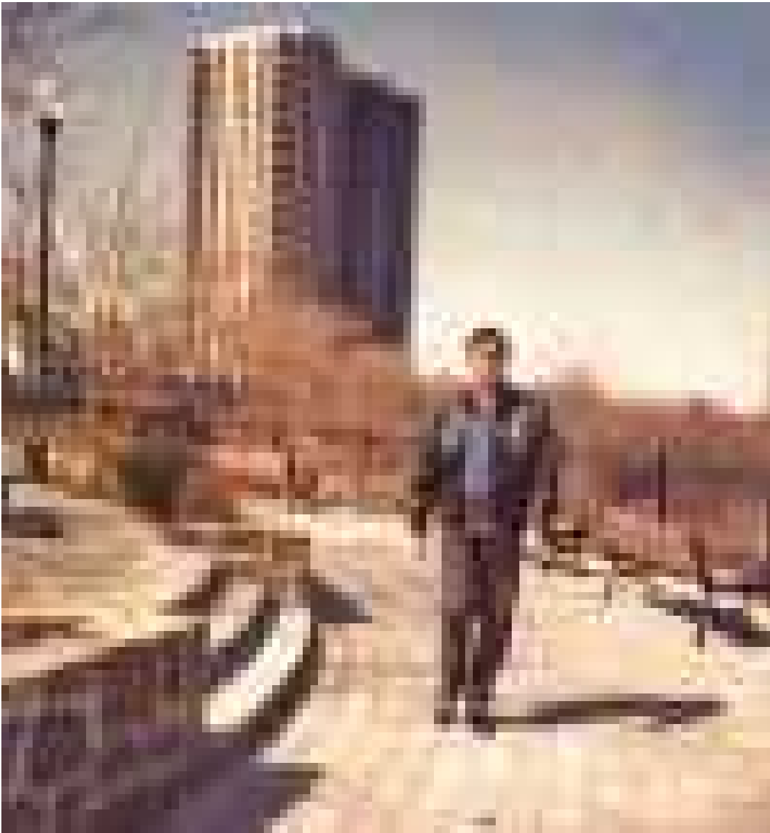
Gualdo-Boulevard East 001.jpg