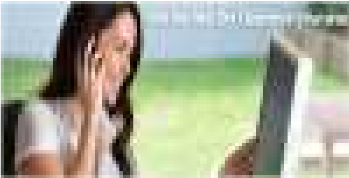
find a dry cleaner2.jpg