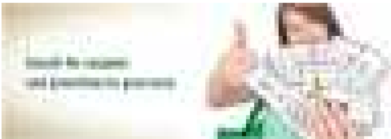
find a dry cleaner1.jpg

Consumers who are looking to find a dry cleaner have a new resource from DryCleaningSearch.com -- 'America's Dry Cleaning Directory.' Dry cleaning owners can also search for vendors, suppliers and professional services to help better run their business.